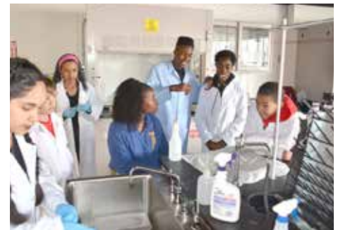
Students and their mentors in the RISE program.

The Education Foundation provided funds for lab supplies and project materials.